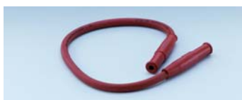
Gas-safety hose for natural gas, slip-on (DVGW-certified)

If the flame stops due to e.g. spilled liquids and the burner may not be re-ignited, the gas supply is automatically and permanently shut.