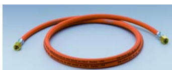
Gas-safety hose for propane/butane, screwed (DVGW-certified)

Sources of energy? You need it - we have it