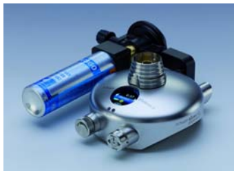
schuett phoenix II with CV 360-adapter incl. pressure reducer and cartridge

Sources of energy? You need it - we have it