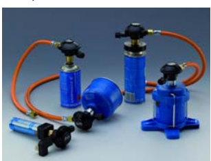
Choice of gas cartridges with adapters, partially including pressure reducer and gas-safety hose.