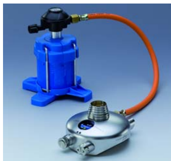
schuett phoenix II with C 206-adapter incl. pressure reducer and gas-safety hose as well as cartridge

The delivery extent of the schuett phoenix II includes a nozzle for natural gas as well as a nozzle for propane/butane gas. In few steps, the nozzles may be exchanged or replaced, without need for tools, according to the required gas.