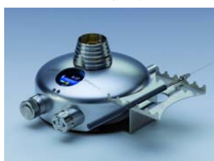
Instrument tray with inoculating loop holder, rotatable for optimum workplace convenience