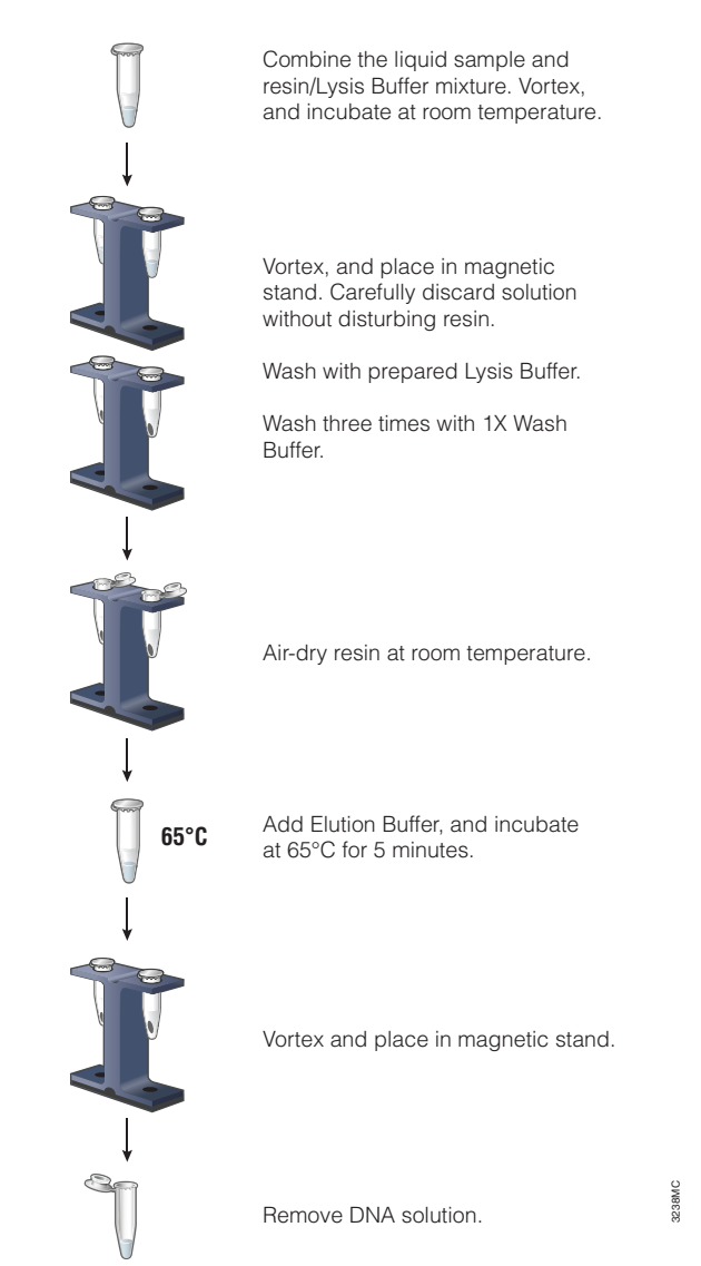
Figure 2. Schematic of DNA purification from liquid samples using the Lysis Buffer preprocessing method and the DNA IQ™ System. See Section 4.F. for a detailed protocol.