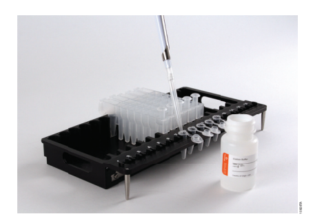
Figure 2. Setup and configuration of the deck tray(s). Elution Buffer is added to the Elution Tubes as shown. Plungers are in well #8 of the cartridge.

4. Add the entire amount of sample lysate processed as instructed in Section 4, Step 6, to well #1 (the largest well) of each cartridge.