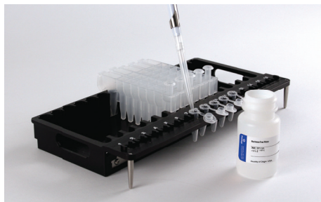
Figure 2. Setup and configuration of the deck tray. Elution Buffer is added to the elution tubes as shown. Plungers are in well #8 of the cartridge.