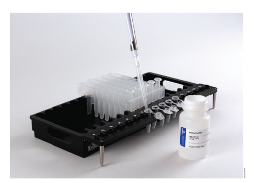
Figure 3. Setup and configuration of the deck tray(s). Elution Buffer is added to the elution tubes as shown. Plungers are in well #8 of the cartridge.