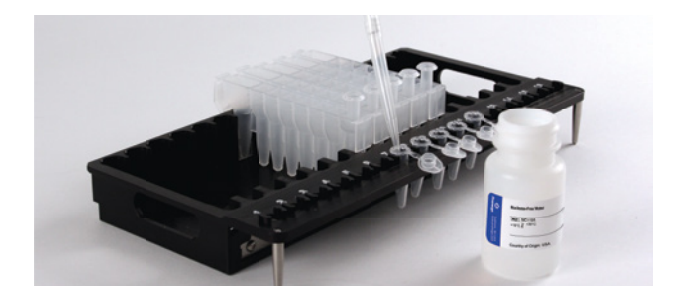
Figure 2. Setup and configuration of the deck tray(s). Nuclease-Free Water is added to the elution tubes as shown. Plungers are in well #8 of the cartridge.

Figure 1. Maxwell<sup>®</sup> RSC Cartridge.