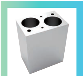
TC0401005-100 2 x 50ml block