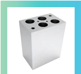
TC0401005-46 4 x 15ml block