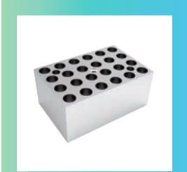
TC0401005-30 24 x 0.5ml block