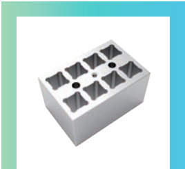
TC0401005-45 8-12.5x12.5x32mm (used in cuvette)