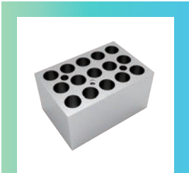
TC0401005-33 15 x 2.0ml block