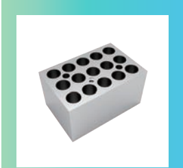
TC0401005-32 15 x 1.5ml block