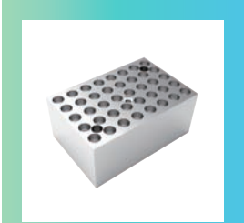
TC0401005-31 40 x 0.2ml block