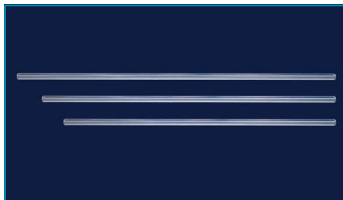
STIRRING ROD - "glass"