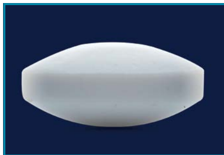
MAGNETIC STIRRING BARS "oval - elliptical"