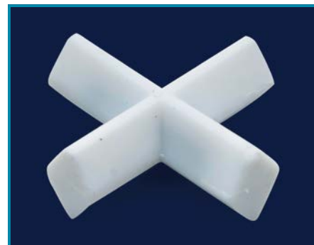
MAGNETIC STIRRING BARS "cross form"