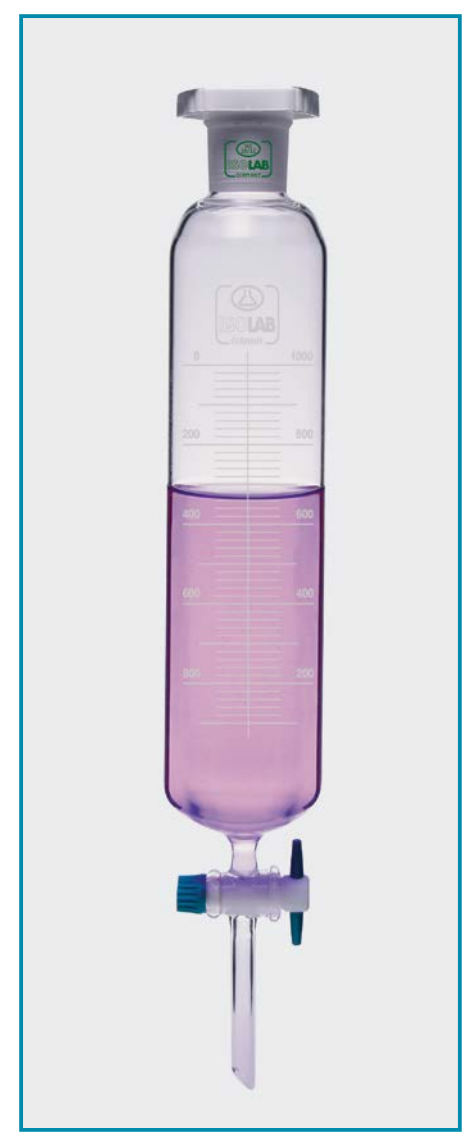
FUNNELS - "separating" "squib" - "graduated"